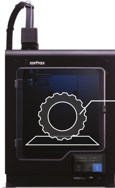
Zortrax M200 Plus 3D printer